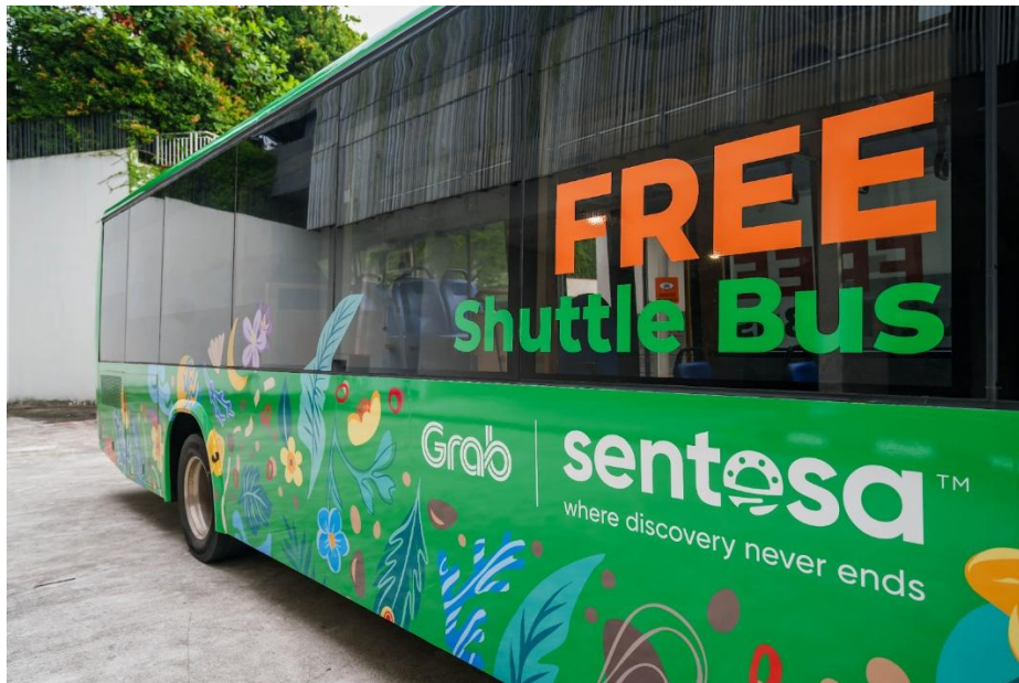
Grab-sponsored shuttle services

Grab’s free shuttle services will operate from Beach Station (Berth 12, 13) to HarbourFront Bus Interchange at the following times: