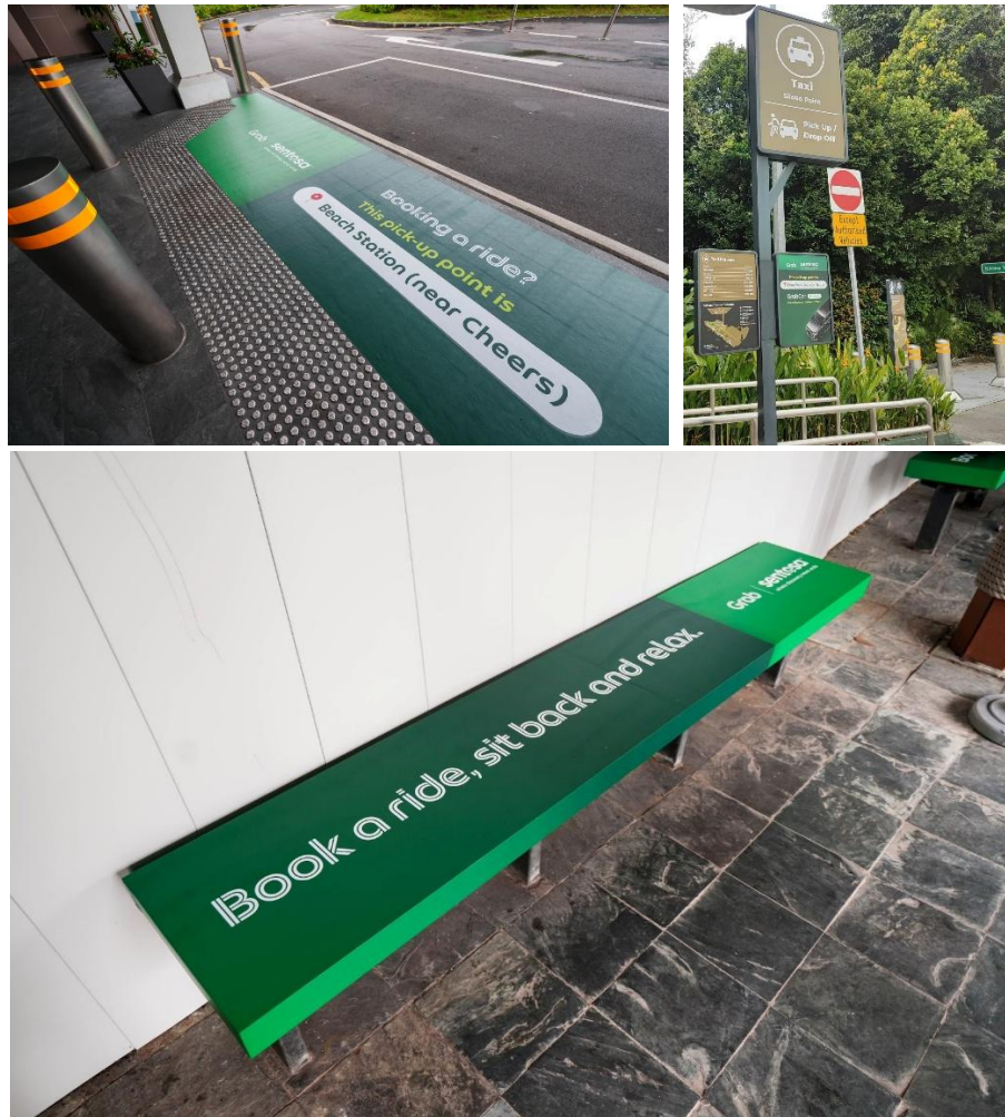
Refreshed pick-up drop-off points for Grab services

All PUDO points have been optimised to minimise walking distances and are marked with prominent signages clearly displaying the exact location. This ensures that users can easily and accurately input the right PUDO locations in the Grab app. Additionally, the Grab app provides clear instructions with supporting images to guide guests to their nearest pick-up points, enhancing the overall convenience and experience for users.