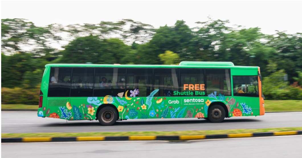
Grab-sponsored shuttle services

Singapore – 4 March 2025 – Grab Singapore and Sentosa Development Corporation (SDC) today announced transport initiatives to enhance connectivity to and from Sentosa island. This announcement marks the beginning of a new three-year partnership between the two organisations, focused on improving accessibility and convenience for visitors.