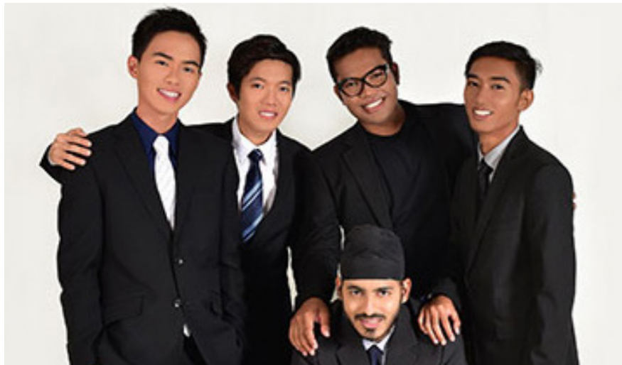
Sentosa Leisure Management