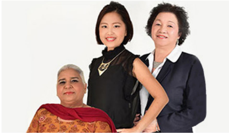
Sentosa Development Corporation Sentosa Leisure Management