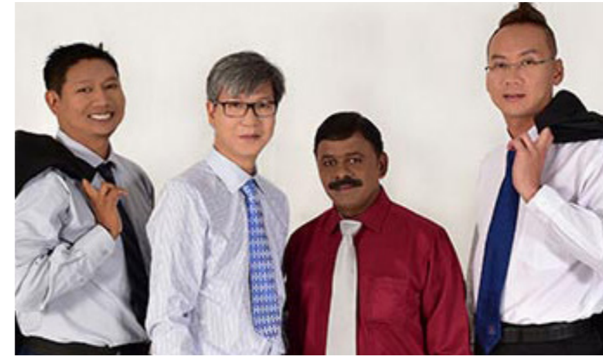
Sentosa Leisure Management