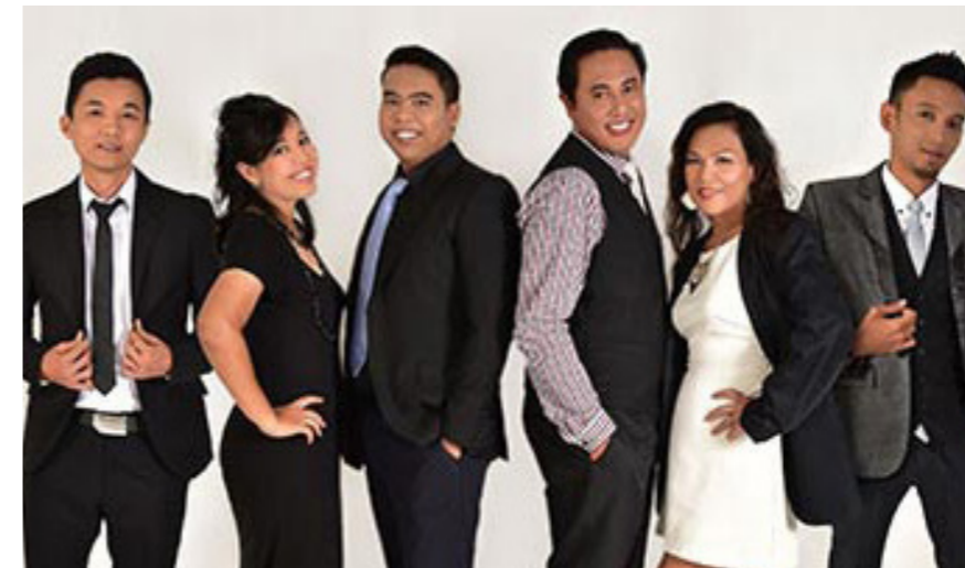
Sentosa Leisure Management