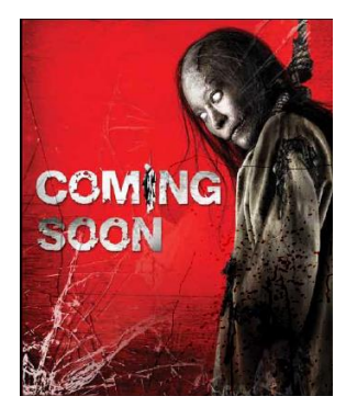
Trail: Coming Soon