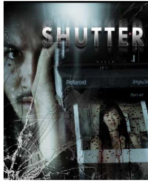
Trail: Shutter House

Every movie goer is cursed by Chaba, who was hung to death by accident due to a technical glitch during filming. Nobody thought of helping her as she suffocated to death during her last scene in front of the whole cast. Everybody thought she was giving the performance of her life. Chaba now curses all who sees the movie, and they are doomed to die.