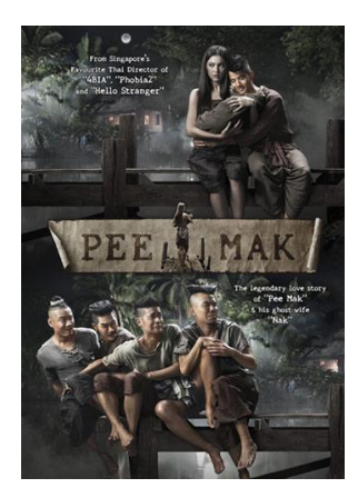
Trail: Pee Mak

Tun, a photographer, begins to discover mysterious white shadows in his photographs, and develops severe neck pains which no doctor has answers to. Further investigation revealed that the white shadows belong to Netre's, his ex-girlfriend who was raped by his best friends. Under peer pressure, Tun had witnessed and taken photos of the accident. His best friends used them to blackmail Netre, resulting in her committing suicide.