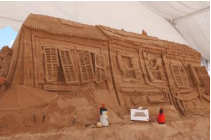
'On a Little Street in Singapore' taking shape