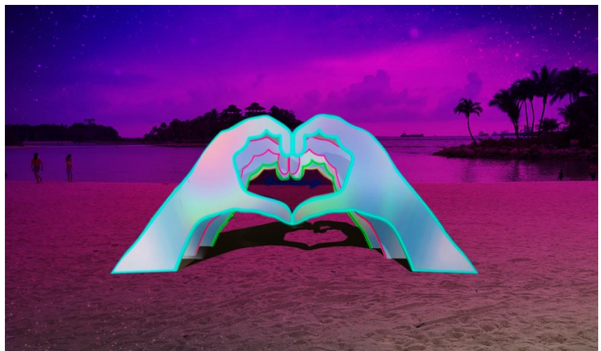
Singapore – 14 November 2018 – The picturesque sunsets of Sentosa's Palawan Beach are set to transform into enigmatic and photo-worthy visual treats with the return of Island Lights , bigger and brighter for the year-end holiday season! Previously known as Pop Up Night, Island Lights 2018 will be home to some 10 Instagrammable installations, as well as the inaugural Pikachu Night Parade outside Japan!