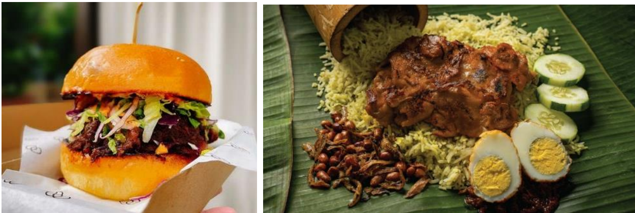
Fan Favourites (left to right): Pulled Beef Cheek Rendang Burger from Sofitel Singapore Sentosa Resort & Spa, Bamboo Nasi Lemak by Arbora Hilltop Garden & Bistro

Singapore's biggest seaside barbecue spread, the Sentosa GrillFest kicks off the entire festival serving up mouth-watering charred delights. Featuring 35 F&B establishments, this will be the biggest edition of Sentosa GrillFest yet. The event this year features three distinct zones, with a new zone, International Delights , where guests can discover new flavours with delectable flame-licked dishes from Egypt; Mexico; Taiwan, Republic of China; South Africa; and more.