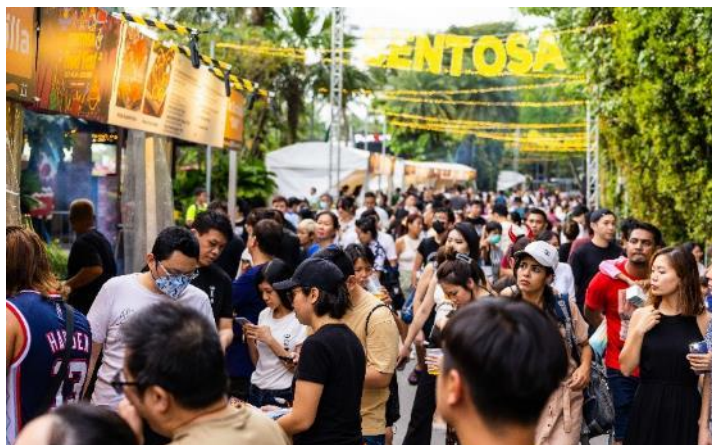
Festival-goers at Sentosa GrillFest 2022

This year, foodies can look forward to three signature events as part of Sentosa Food Fest – Sentosa GrillFest (7 to 30 July), Sentosa Restaurant Trail (14 to 25 August) and Sentosa Food Truck Fiesta (1 to 17 September) as well as a line-up of fringe events to keep guests coming back for more.