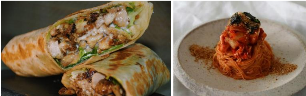
International Delights (left to right): Egyptian cuisine from Huras, Korean street food from Hanok Kimchi

Siloso Beachfront. Every Friday to Sunday, 5pm to 9pm