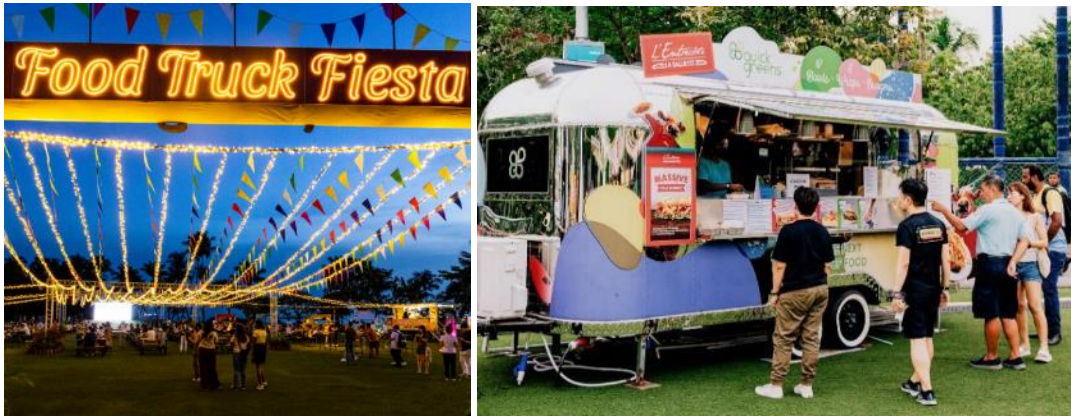
Festival-goers at Food Truck Fiesta 2022

Palawan Green. Every Friday to Sunday, 5pm to 9pm