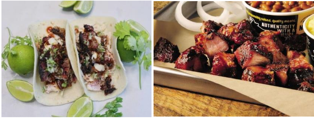
Grill By The Beach (left to right): Jett Barbecue, Dickey's Barbecue Pit