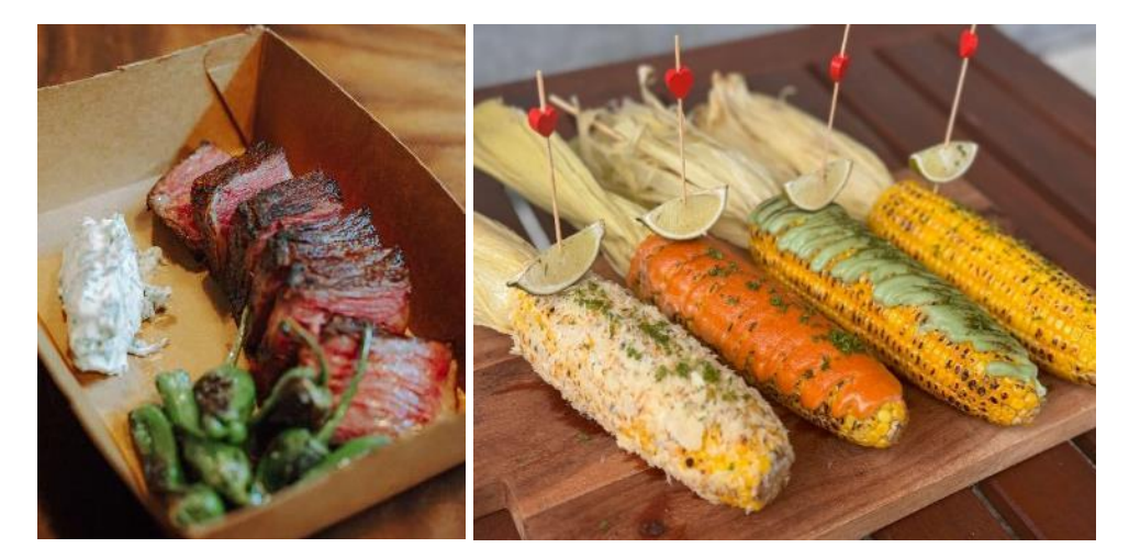
(from left) Gunpowder Short Ribs from Pilot Kitchen, and BBQ Corn with signature spreads from Ola Beach Club Guests can look forward to five GrillFest exclusives this year:

Shredded Spiced Chicken), while Ola Beach Club puts their spin on barbecue corn with a trio of unique sauces.