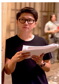
Banjong Pisanthanakun GTH's Director for box office smash hit, Alone