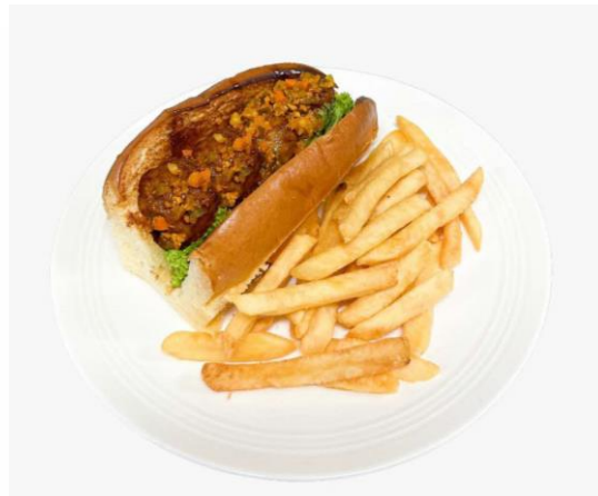
Left to right: KMSH Signature Duck Rice Plate by Kin Men Seng Heng, "Bak Chor" Meatball Roll by Crowne Plaza

This year's Food Truck Fiesta will also feature authentic local delicacies with a fusion twist. For a homely and traditional dish, look no further than Muslim-owned Kin Men Seng Heng's take on the Hokkien braised duck in their Signature Duck Rice Plate crafted by a third-generation Singaporean hawker. Crowne Plaza's food truck offers a new take on local favourites such as "Bak Chor" Meatball Rolls, Beef Satay Burger, and more.