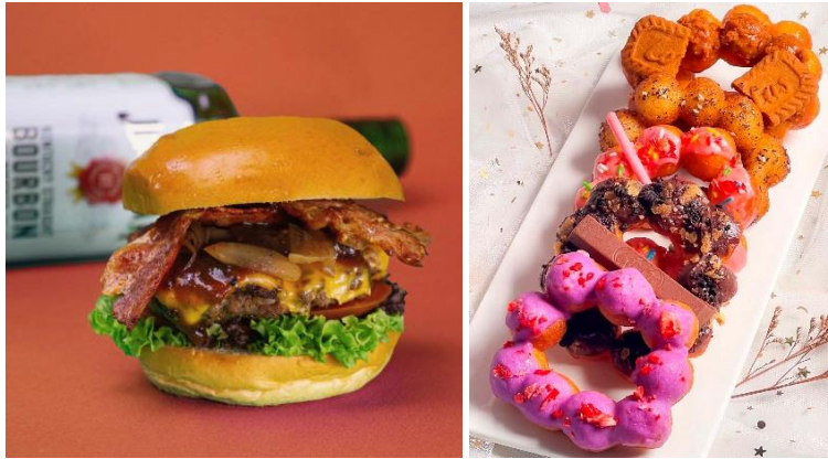
Left to right: Bourbon BBQ Bacon Beef Burger from Fatty Patty, and Pon De Ring Mochi Donuts from SugarBellySG

Foodies can further take their taste buds on a culinary journey with crowd favourites such as Fatty Patty's Bourbon BBQ Bacon Beef Burger served with alcohol-infused sauces and their indulgent Truffle Aioli Beef Burger. Eventgoers can end their meal on a sweet note with delightful treats from SugarBellySG , showcasing Singapore's first sugar- and egg-free Pon De Ring Mochi Donuts, as well as artisanal brownies such as their Mao Shan Wang Durian Creme Brownie.