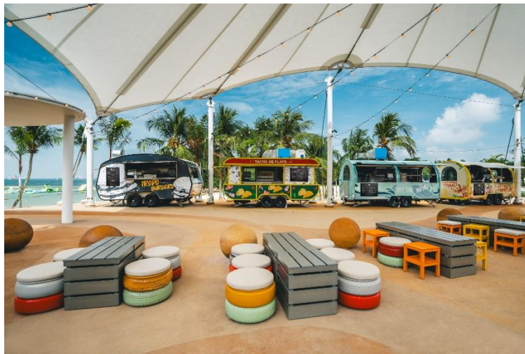
Canopy area with seating at The Palawan Food Trucks

The Palawan @ Sentosa, Sunday to Thursday 11am-7pm, Friday to Saturday, Eve of and Public Holiday 11am-9pm. Free admission