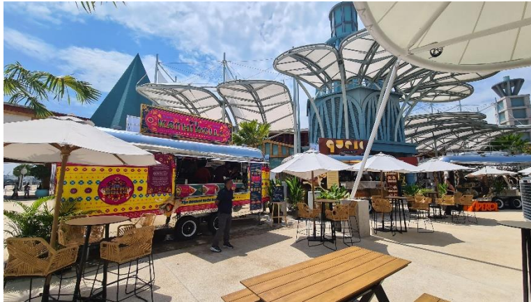
Food trucks and seating at Gourmet Park

The Bull Ring, Level 1, Monday to Friday 11am-8pm, Saturday and Sunday 11am-9pm, Free admission