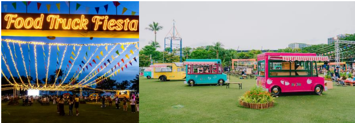
Festival grounds during the evenings of the inaugural Sentosa Food Truck Fiesta in 2022

Singapore, 28 August 2023 – The Sentosa Food Truck Fiesta 2023 will return for a bigger, second edition with 10 food truck entrepreneurs joining the Fiesta for the first time! They will join four other local “hawkerpreneurs”, home-based bakers, and young culinary talents to serve up an array of tasty and affordable street food to revolutionise the culinary adventures of eventgoers. Taking place at the Palawan Green every Friday to Sunday, 5pm to 10pm from 1 to 17 September, the last signature event of Sentosa Food Fest 2023 will bring foodies on a gastronomical experience with elevated street food served with a twist.